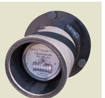
MILEAGE COUNTER, HECTARE COUNTER