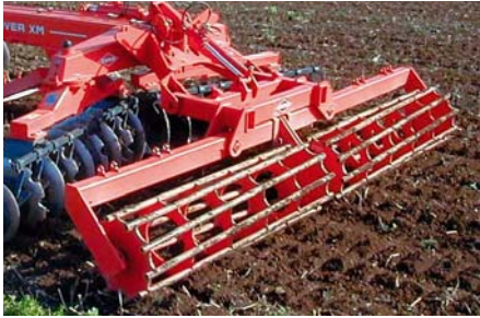
CRUMBLER ROLLER Ø 550 - 75 kg/m

Roller (as option) with mechanical suspension on XS and XM2. In folded position, the roller remains within the overall dimensions of the machine.