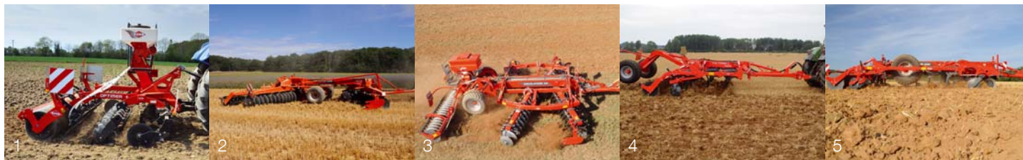
1. OPTIMER+ 2. DISCOVER 3. DISCOLANDER 4. CULTIMER L 5. PERFORMER

For more information about your nearest KUHN dealer, visit our website www.kuhn.com