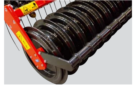
T-LINER ROLLER Ø 600 - 140 kg/m