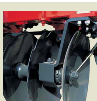
BEARING STATION SAFETY