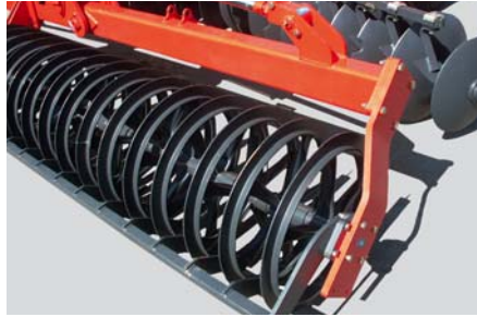
T-RING ROLLER Ø 600 - 130 kg/m