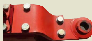
DIFFERENT HITCH FRAMES ARE RECOMMENDED